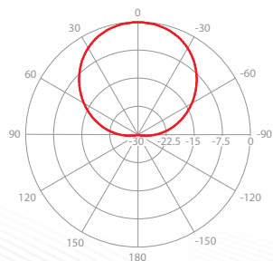
V/H - Port Pattern Azimuth 5.6 GHz