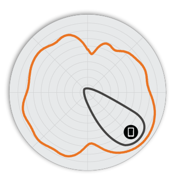
Figure 4. R550 2.4GHz Elevation Antenna Patterns