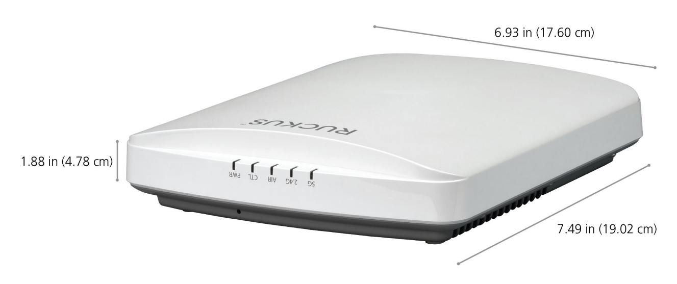
Weight: 1.24 lbs (0.562 kg)