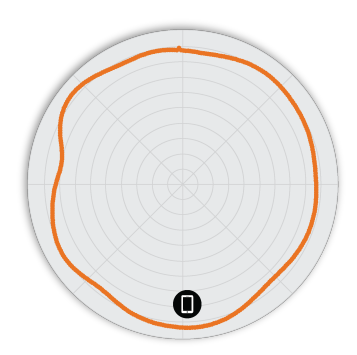
Figure 2. R550 2.4GHz Azimuth Antenna Patterns