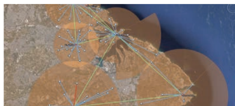
GOOGLE EARTH NETWORK VIEW