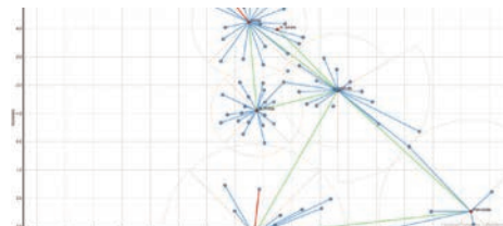
MAP OF THE SITES AND LINKS IN THE PROJECT